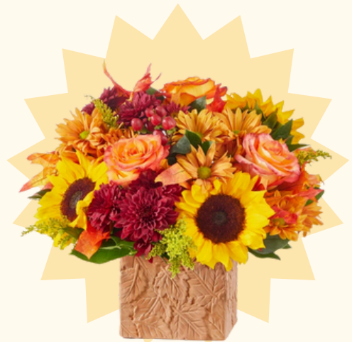
THE OUTDOORS BOUQUET