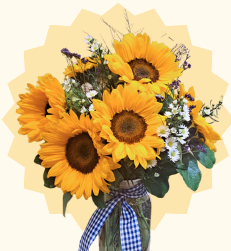
BAYPORT'S BEST SUNFLOWER SUNSHINE