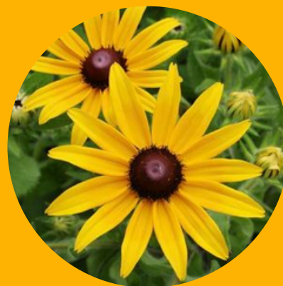
Black Eyed Susan Rudbeckia