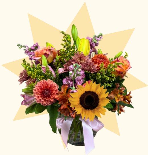
BAYPORT'S BEST GARDEN CLASSIC