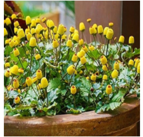
Toothache Plant Acmella oleracea