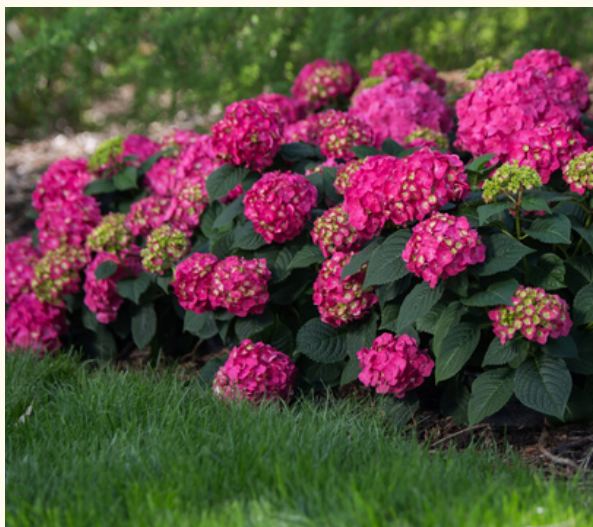
Summer Crush® Reblooming Hydrangea