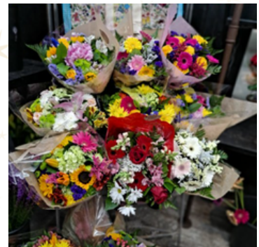
Bayport's Best Unique Bouquets