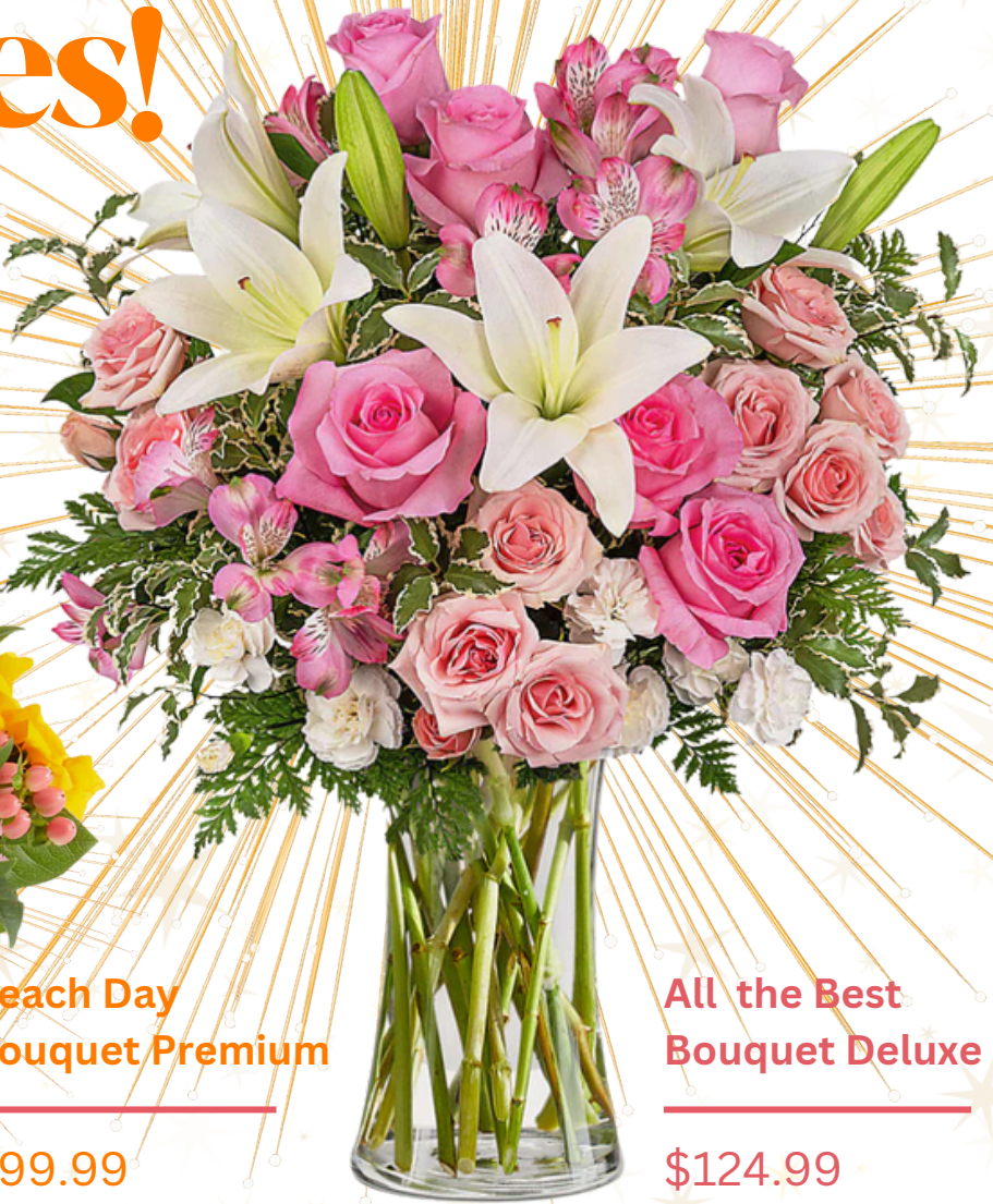
All the Best Bouquet Deluxe