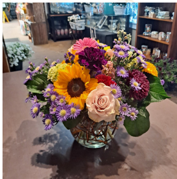
Bayport's Best - Garden Classic