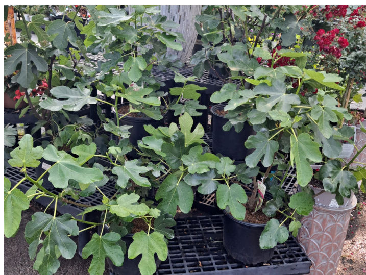
Fig Trees starting at $87.99