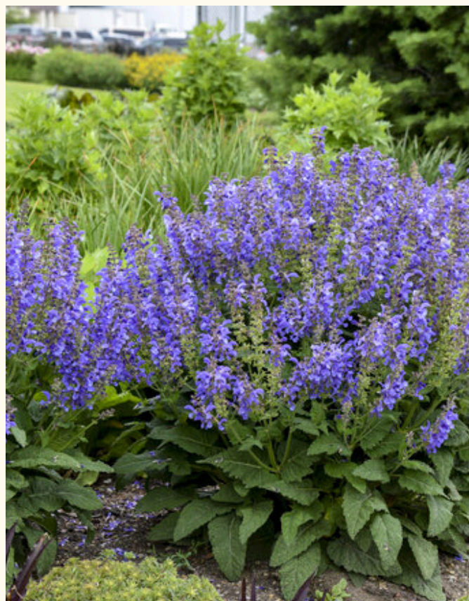
Noble Knight Perennial Salvia Available in 1 gallon pots

Weeds are another hidden culprit: they compete for water and nutrients , so regular weeding helps keep your plants hydrated and fed.