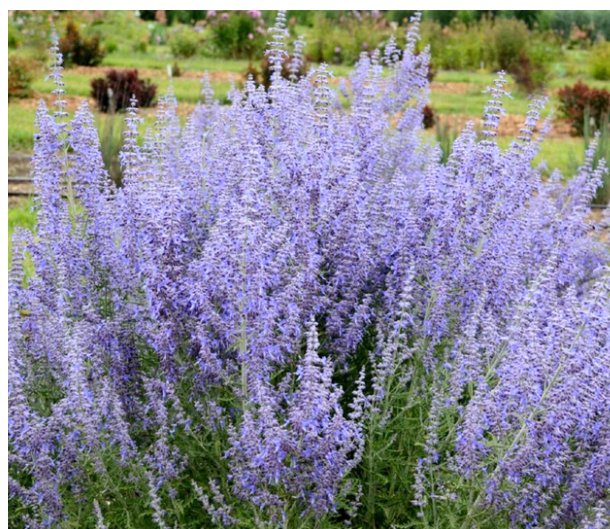
Russian Sage Salvia yangii