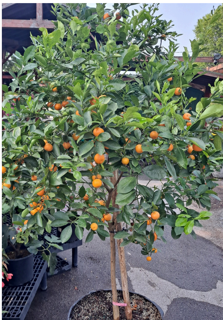
Calamondian Tree (pictured), $225 Other Size Citrus Trees starting at $59.99

Give Dad something he can grow and—literally—enjoy the fruits of his labor (dad joke totally intended). From citrus to fig to other fruiting trees, we've got options to fit just about any backyard. Worried about winter? We've got that covered too. Our Overwintering Services let our expert staff care for your fruit trees or other plants through the cold months, so they'll keep thriving season after season.