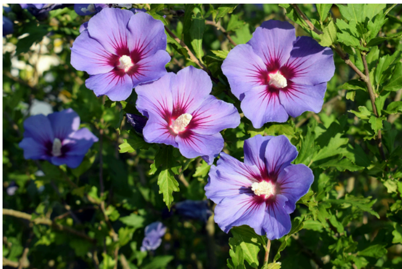
Rose of Sharon Hibiscus syriacus

For annuals, I have too many favorites to pick just one! Some of my favorites are zinnias, angelonias, and coleus.