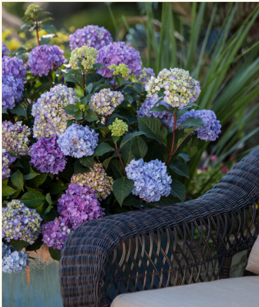
BloomStruck® Reblooming Hydrangea