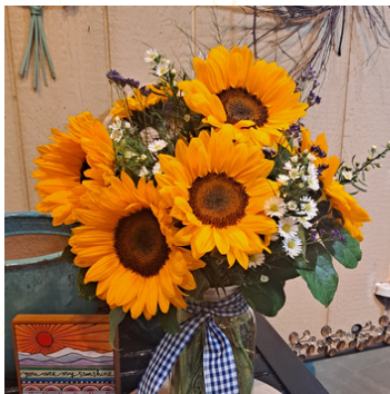
Bayports Best Sunflower Shine