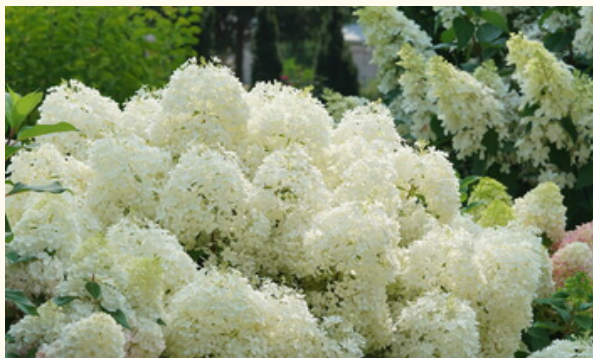
Puffer Fish® Hydrangea