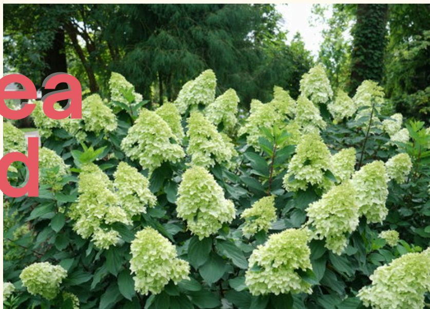
Limelight Prime Hydrangea

Valid In-Store at Bayport Flower Houses from June 13 - 16, 2025 Only. Not valid on gift cards, classes or past purchases. Cannot be combined with other offers.