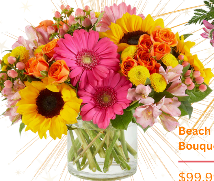
Beach Day Bouquet Premium

Present stunning flower gifts that shine as brightly as their future! Our handcrafted bouquets and arrangements make it easy to find the perfect surprise for your exceptional graduate.