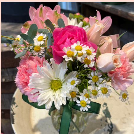
Deluxe Tussy Mussy $24.99