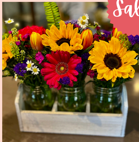
Farmer's Market Wood Box Trio $49.99 regularly $64.99