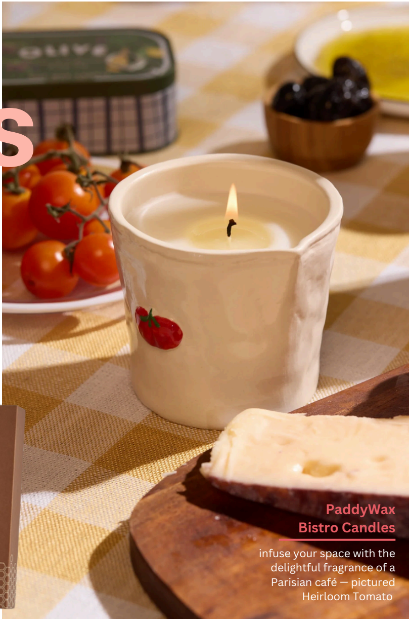
PaddyWax Bistro Candles

made with beeswax these candles are clean-burning, long-lasting, & luxurious.