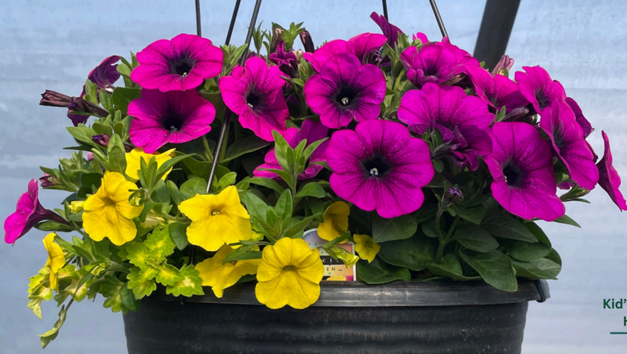
Kid's Mother's Day Hanging Basket