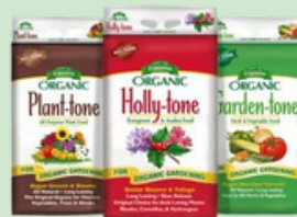
ESPOMA GARDEN FERTILIZERS