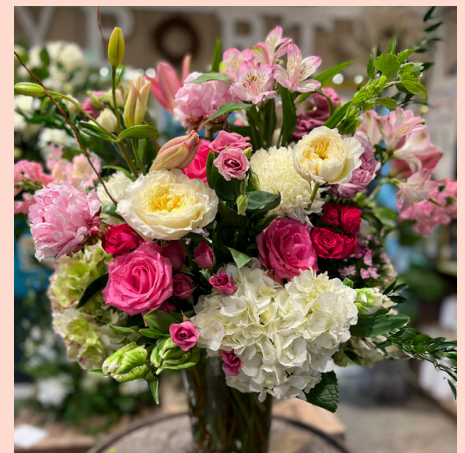
Bayport's Best Grand Gesture $300