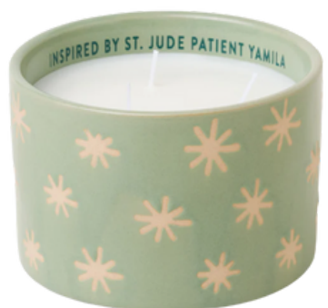
St. Jude Giveback "Inspire" 11 oz. Candle

with peaceful and uplifting notes of eucalyptus & mint.