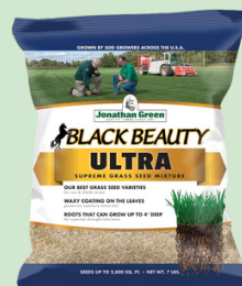
JONATHON GREEN - BLACK BEAUTY GRASS SEED