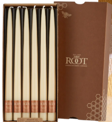
ROOT Taper Candle Sets

with peaceful and uplifting notes of eucalyptus & mint.