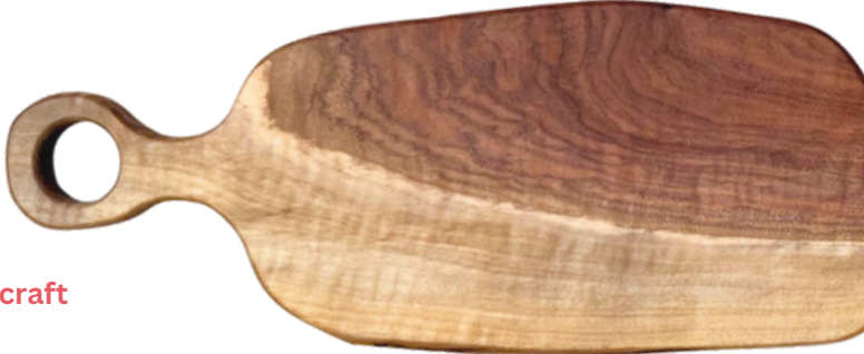
EF Woodcraft Designs

Let your appetizers take center stage on beautifully crafted, locally made wooden charcuterie boards.