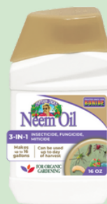
CAPTAIN JACK'S NEEM OIL