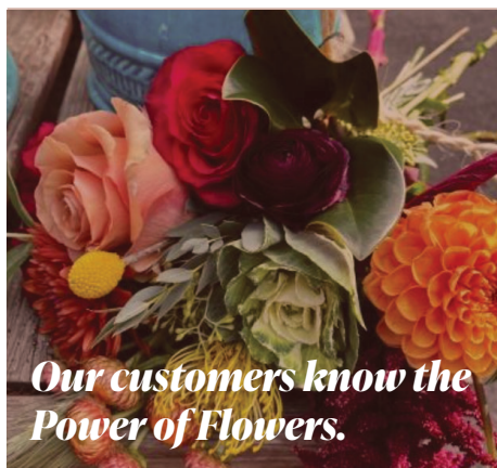
Our customers know the Power of Flowers.

full-service floristry are for every occasion, from a sweet tussy mussy to grand wedding décor and everything in between. We are your hometown tradition and can give you our full attention, bringing joy to any occasion. We are the GO-TO for impressive flowers. Guaranteed!