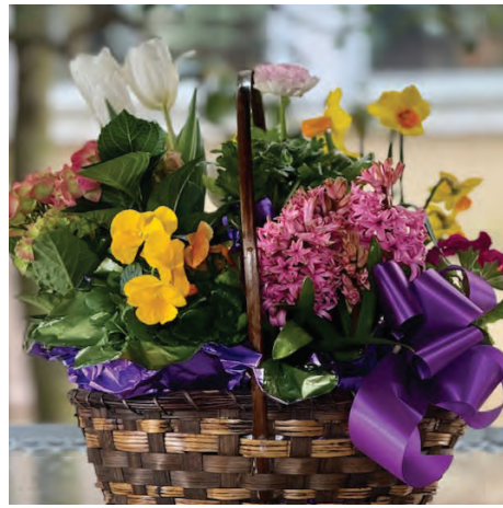
Garden of Seasonal Blooms