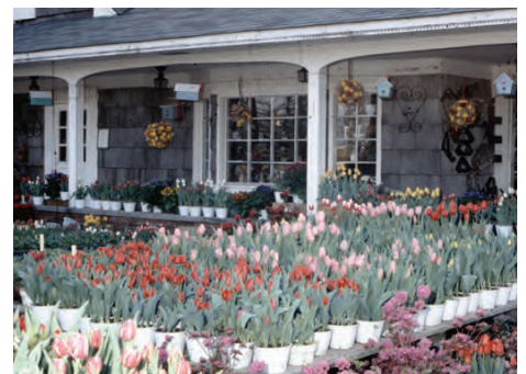
Beginning of direct-to-market flower sales - circa 1970s