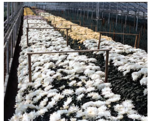
Mums growing for wholesale in greenhouses before day light manipulation technique - circa 1960s.

From cut stems to flourishing gardens, we're here because of you!