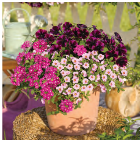
Homegrown Combination Pots