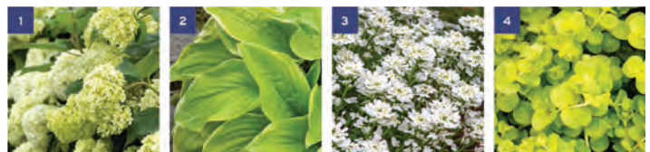
Seaside Serenade® Bar Harbor Hydrangea Fragrant Bouquet Hosta Snowsurfer™ Forte Candytuft Golden Creeping Jenny

All 'Welcoming Entry' materials and plans are created by Monrovia and adapted to fit this format.