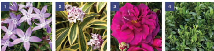
Arctic Falls™ Bellflower Banana Split® Daphne Eau De Parfum™ Berry Rose Boxleaf Euonymus