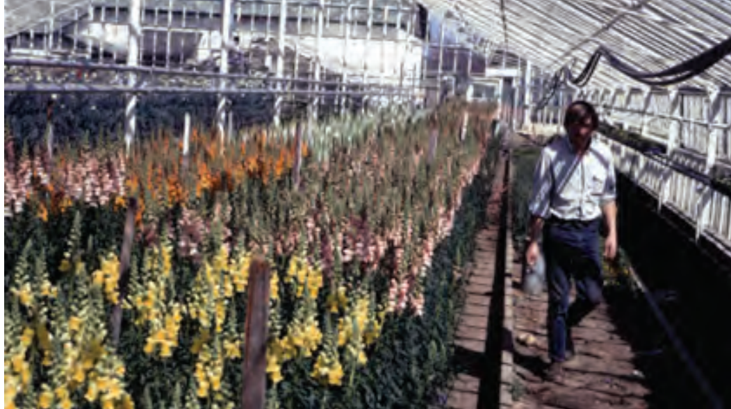
Snapdragons growing in our original greenhouses for wholesale in NYC markets - circa 1960s

Back in the early years, Bayport Flower Houses was all about wholesale flower cultivation. It was a slower pace; our original greenhouses and eastern fields were filled with flowers destined to be sold as cut flowers in the bustling New York City flower markets. In these days, growers at Bayport Flower Houses had to follow the patterns of the seasons – no artificial heat and no out-of-season blooms. Take mums, for instance—they were daylight-sensitive, blooming only during shorter days. Come early fall, we'd harvest them for Thanksgiving and the autumn markets. It was a natural cycle, a symphony of growth.