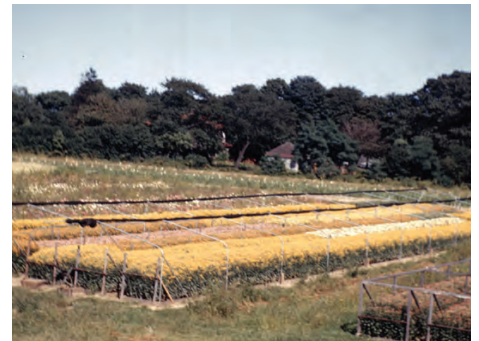
Mums growing in our Eastern field before day light manipulation technique - circa 1960s.