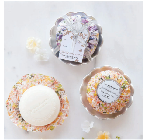
Primavera Soap & Dish Set

Our signature Spring bouquet! Handcrafted & thoughtfully wrapped by our experienced floral designers, this timeless bouquet highlights our colorful Dutch tulips.