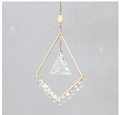
Scout Mini Suncatcher

Blue Q Tote bags are made of 95% post-consumer recycled material, making them both beautiful and environmentally friendly. They are great for hosts and are also convenient for carrying food, drinks, and other treats to your spring party.