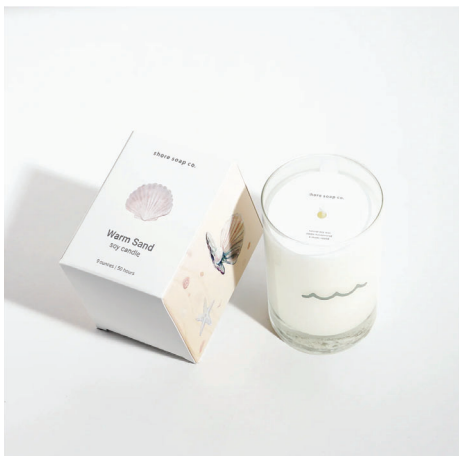
Shore Soap Co. Candle

Available in plum blossom, peach blossom, & red currant, this Spring Blossom Collection celebrates the joys of Spring & Summer. With vibrant colors & fresh fragrances, it's a luxurious & thoughtful gift for any occasion.