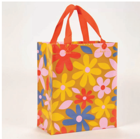
Blue Q Groovy Flower Tote

As a community by the sea—Shore Soap Co. candles capture that vibe with scents like Warm Sand & Mermaid Kisses. Plus, it's thoughtfully crafted, clean burning, & comes in a reusable tumbler glass. A delightful gift for any host!