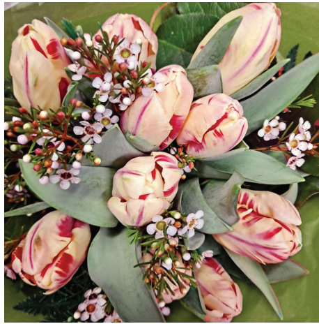
Timeless Tulips Bouquet

As the warm weather arrives, so do more holidays, parties, & dinners. With those occasions comes the delightful task of selecting host gifts. Fear not! At Bayport Flower Houses, we're here to ensure you never arrive empty-handed. Our carefully curated guide features the perfect party gifts that express both your gratitude & impeccable taste.